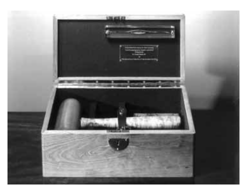
Figure 3. "The international Gavel", sponsored by the CNS, was presented on behalf of the five American National Societies to the World Federation of Neurosurgical Societies at its first World Congress in Brussels, Belgium in 1957